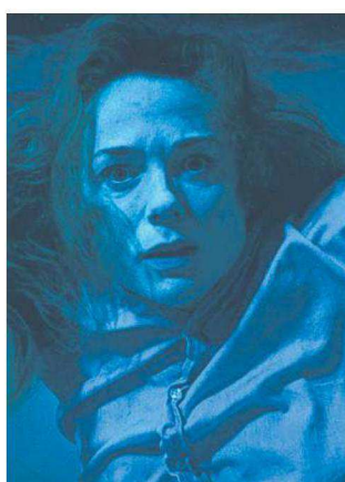
Kerry Condon in Night Swim.

Germany has blocked arms sales to Riyadh since the 2018 murder of journalist Jamal Khashoggi in the Saudi consulate in Istanbul.